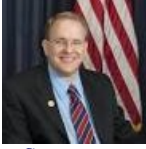
Congressman Jim Langevin

WARWICK, R.I. -- Congressman Jim Langevin (D-RI) issued the following statement from Jim after